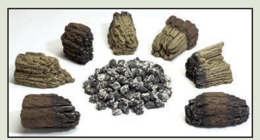
EK-2 Large Log Ember Kit

The EK-2 Ember Kit complements the Rock Creek or Stone River log set with seven large burnt log chunks and a generous mound of white and gray ashes to create a satisfying well-used fireplace appearance. (For Vent-Free Fireplaces and Fireboxes only)