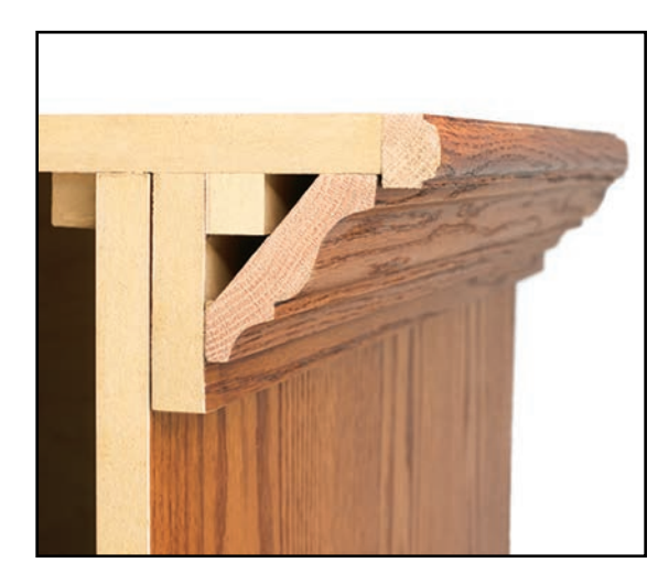
Furniture-grade cabinetry components and 3/4-inch real wood moldings ensure lasting beauty

Choose from one of seven finishes – cherry, nutmeg, dark oak, oak, white, unfinished oak, and unfinished hardwood.