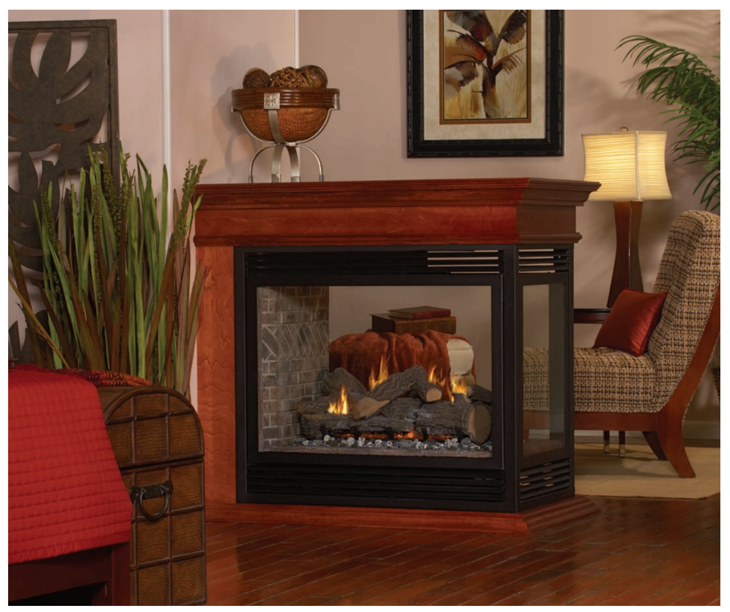
The Tahoe Premium 36-inch Peninsula Direct-Vent Fireplace includes the 35,000 Btu Slope Glaze Vista Burner (for use with Rock Creek refractory log set only), large tempered glass view windows, and Banded Brick Liner. Shown with Peninsula Mantel and Base in Nutmeg finish. Fireplace also available in See-Through models with two open sides.