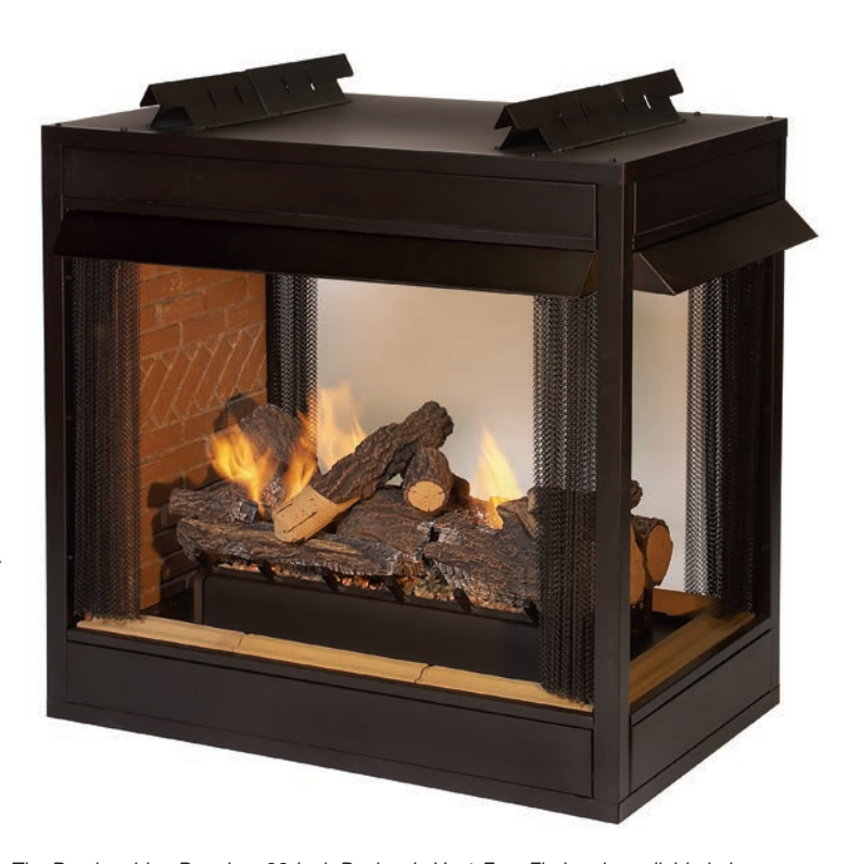
The Breckenridge Premium 36-inch Peninsula Vent-Free Firebox is available in louver or flush-face (shown) and includes curtain screens. Shown with Slope Glaze Vista Burner and Rock Creek refractory log set. Also available in See-Through models with two open sides.