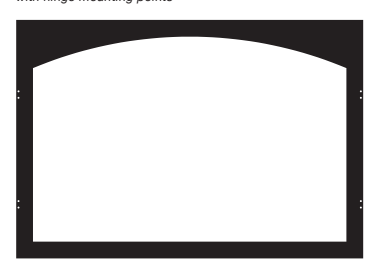
Decorative Frame Arch