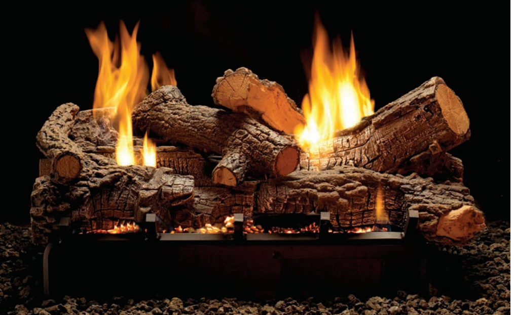
Rugged looking refractory logs give the Rock Creek Log Set a rustic look on a grand scale. Top Left: End view. Bottom Left: Opposite side view.