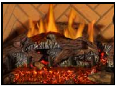
Premium log and burner are a unitized system. Patented ceramic Ember Ramp burner generates a smoldering glow.