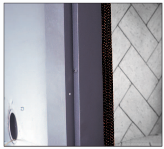
With innovations like hidden screen pockets, you see only the beauty of flame, logs and ember bed.