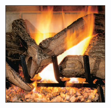
The Pueblo's premium gas logs and glowing ember bed offer the rich ambience of a real wood fire with dancing yellow flames.