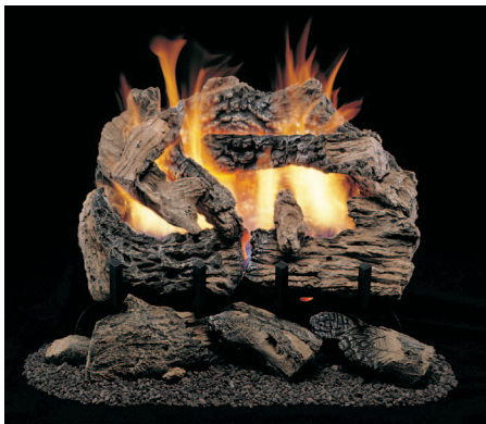
Unitized log arrangement is intricately detailed. 18" model shown.

The Sheridan's unitized, fully assembled design also makes installation a breeze! Just complete the gas connection using the shut-off valve and stainless flex connector provided. Like all FMI logs, the Sheridan doesn't require any break in or "burn off" period, so you can enjoy your new heater instantly with the convenience of the hand-held remote control.