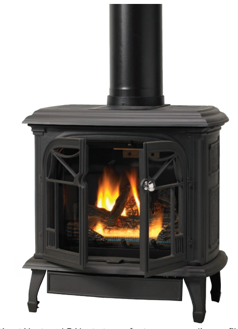
Direct Vent and B-Vent stoves feature a new slim profile.

additional warmth. Vantage Hearth's B-Vent Stoves use standard four inch B-vent pipe.