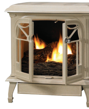
Antique White - CISAW