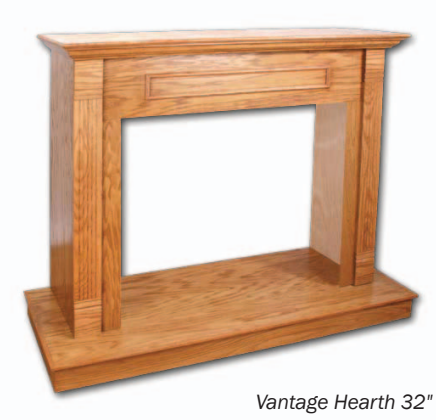
Cabinet Mantel with Oak Finish