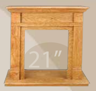
21" Wall Mantel -Traditional Design (W21TO)