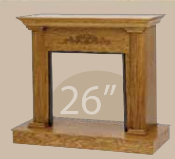
26" Wall Mantel - Georgian Design (GMC80FB)