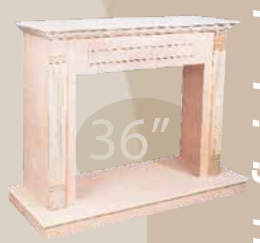
36" Wall Mantel - Traditional Design (W36TU)