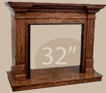
32" Wall Mantel - Classic Design (CMA312FC)