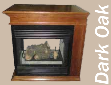
Peninsula Mantel - Traditional Design (PM360) Shown with Peninsula DV Fireplace