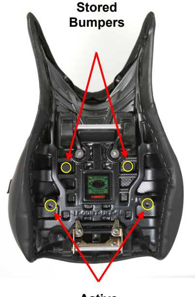
Active Bumpers (HIGH Position)