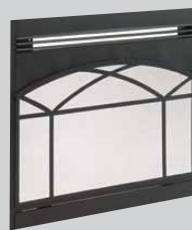
Interlocking Arch face panel