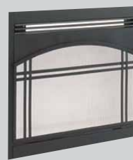
Mission Style face panel