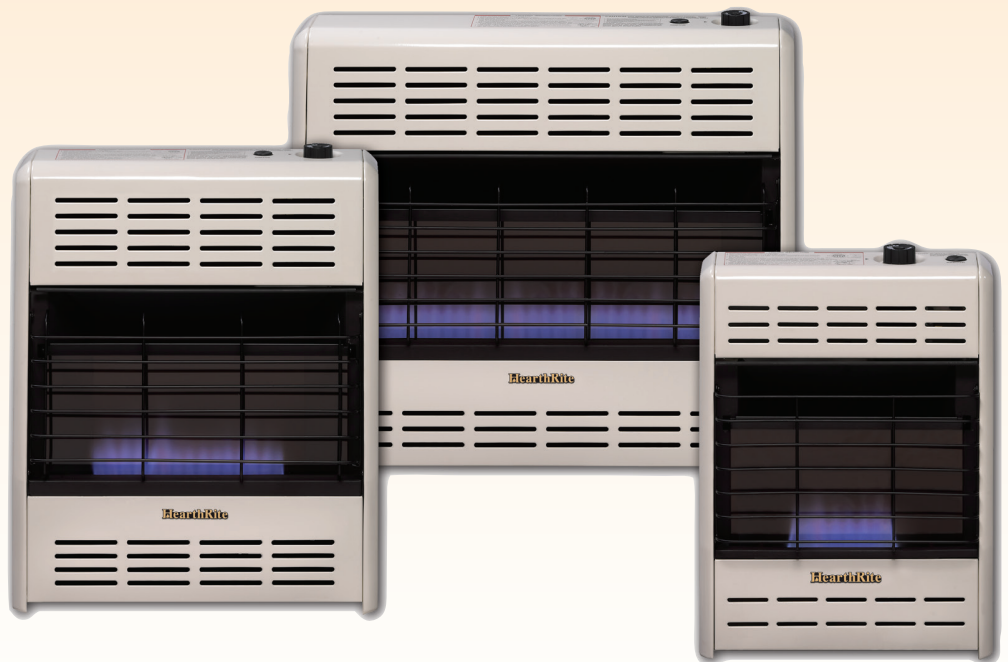
Blue Flame Vent-Free Gas Heater