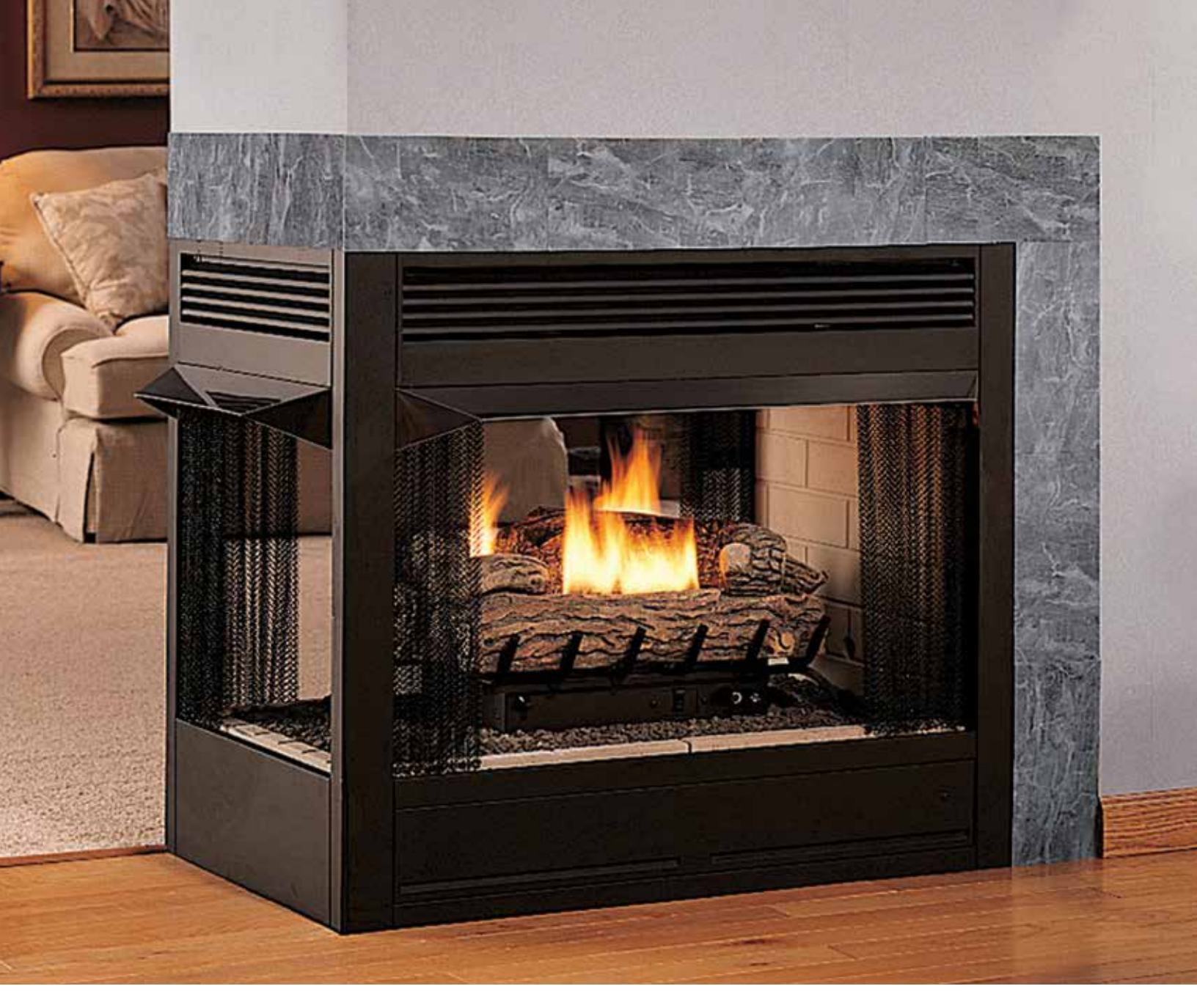
FEATURED VRC43PF with multi-sided log set.