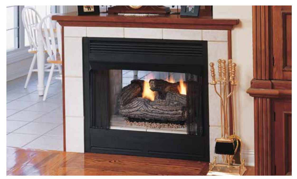
FEATURED VCT43ST with multi-sided log set.