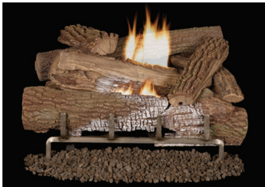
MOSSY OAK Outdoor