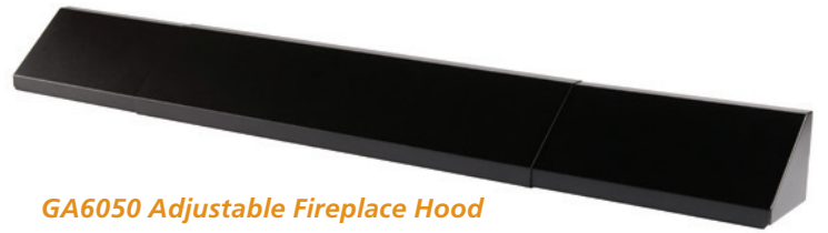
GA6050 Adjustable Fireplace Hood