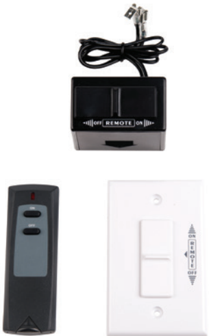
RCKIT 4001 On/Off Remote Receiver Wall Plate Kit