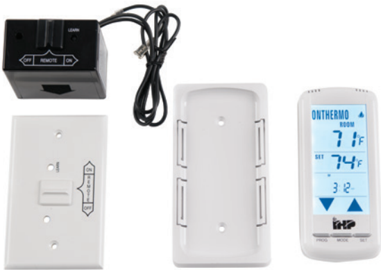
TSRC Receiver Touch Screen Remote Kit