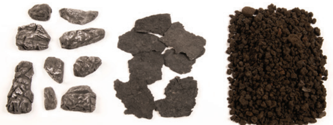
FM100 Floor Media Kit (3 media types) or Separate FDVS Volcanic Stone