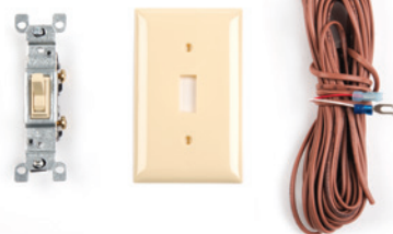
GWMS2 On/Off Wall Switch Kit