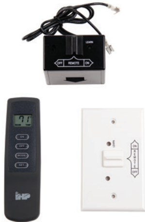
TRC T'stat On/Off Remote Kit