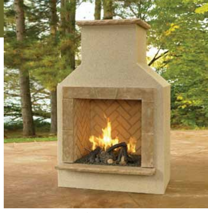
NOTE: Printing color may vary slightly from actual product.

Bring a feeling of warmth to your backyard! With a unique arch design, the San Juan Fireplace is a beautiful addition to your Outdoor GreatRoom ™. The high-heat output will warm you and your guests so everyone can enjoy those cool nights. You won't believe how quickly you can transform your backyard into a wonderful sactuary for family and friends.