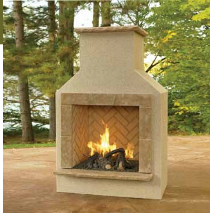
NOTE: Printing color may vary slightly from actual product.

Bring a feeling of warmth to your backyard! With a unique arch design, the San Juan Fireplace is a beautiful addition to your Outdoor GreatRoom™ . The high-heat output will warm you and your guests so everyone can enjoy those cool nights. You won't believe how quickly you can transform your backyard into a wonderful sanctuary for family and friends.