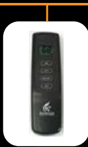
ON/OFF Remote with Thermostat (THR-2R)