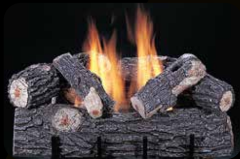
C1 Single Burner

Birch style log set. Bark style shown on front.