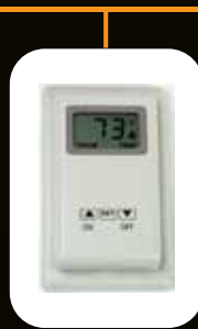
Wall Thermostat (TS-2R)