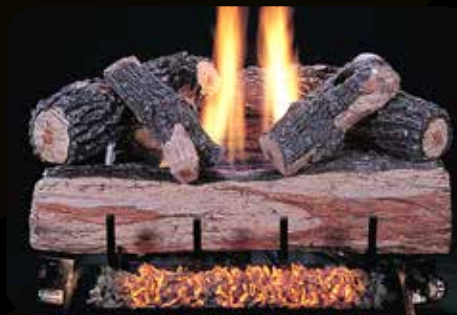
C2 Dual Burner