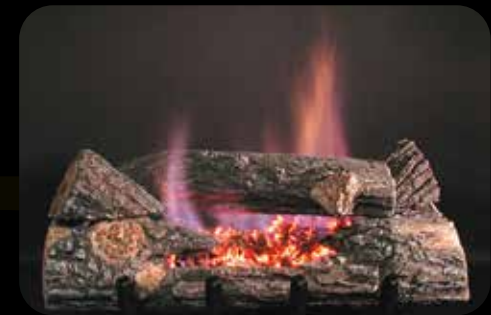
DFC7 Single Burner

Chillbuster CoalFire™ lets you enjoy the traditional look of a coal burning fireplace without the mess, smell or cost. Coal chunks are cast and colored just like our logs for years of trouble-free use. Available in 15” and 19” sizes to fit small Victorian and coal fireplaces.