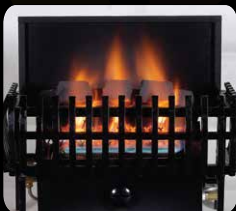
C9 With “Classic” Basket