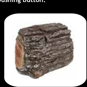
Ceramic Log House for all remote receivers (RH2)

NOTE: Any of these five transmitters will operate the (RE), but they do not include the "one touch" shut-down featured on the remote included with the (RE).