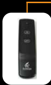
ON/OFF Remote (SR-2R)

Light burner and adjust flame height by pushing button.