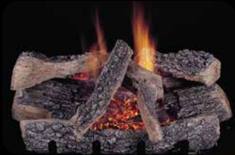
C5 Triple Burner