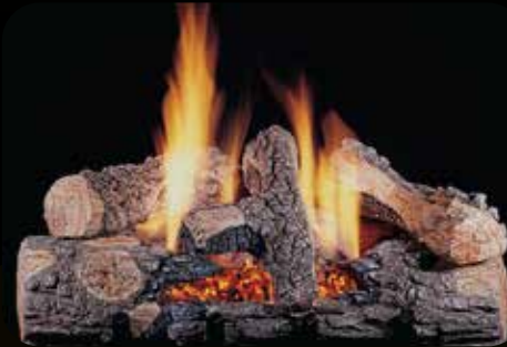
C7 Single Burner