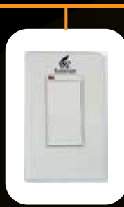
Wall Switch (WS-2R)