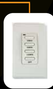
Wall Timer (WT-2R)