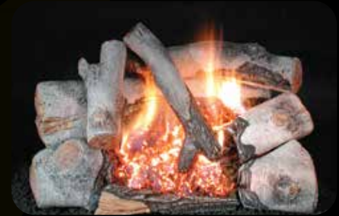
C8 Dual Burner

Birch style log set. Bark style shown on front.