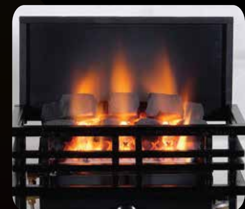
C9 With “Americana” Basket

C9 CoalFire™ with coals is also available separately for use with the basket of your choice