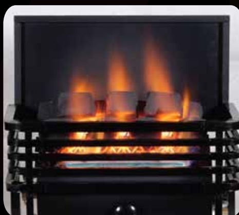
C9 With “Moderne” Basket