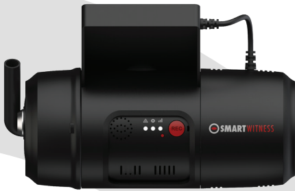
Rear View - Driver Facing