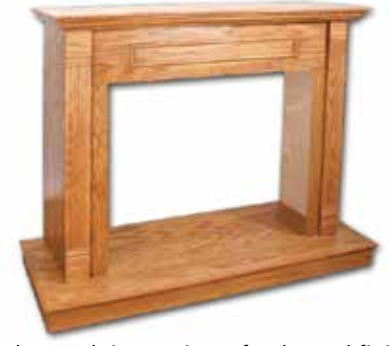
Wood mantels in a variety of styles and finishes