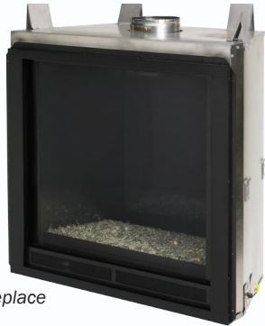
Elegant Aura Direct Vent Fireplace