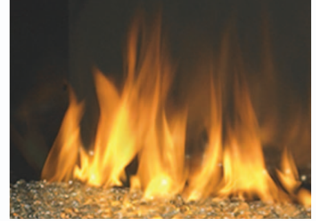
Variable flame, low profile, hidden pan burner for amazing flame!

The top, direct vent configuration of the Elegant Aura provides a wide variety of convenient venting options using our 5"/8" coaxial chimney system. The solid steel chassis face includes heavy, continuous nailing flanges and drywall stops around the face frame for solid installation, and includes a tough, textured powder coat finish.