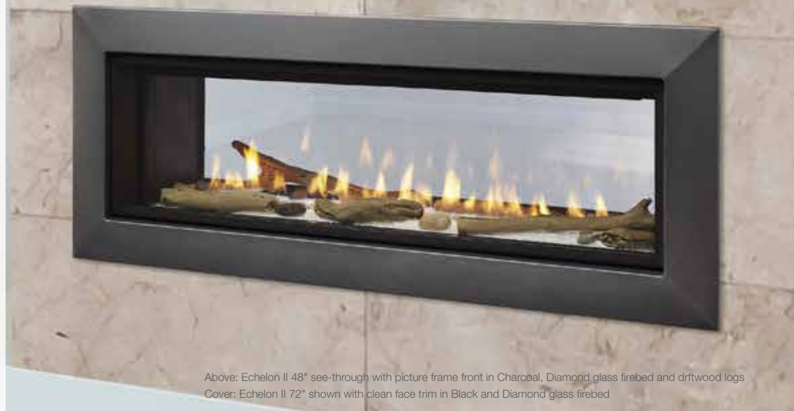
Above: Echelon II 48" see-through with picture frame front in Charcoal, Diamond glass firebed and driftwood logs Cover: Echelon II 72" shown with clean face trim in Black and Diamond glass firebed