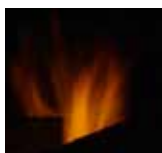
Reflective Black Glass (single-sided only)