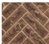
Tavern Brown Herringbone (single-sided only)