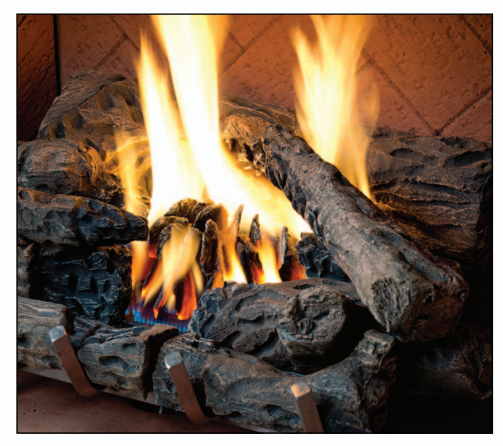
Alpine models feature random natural flame patterns.

Alpine is an extremely economical installation since it requires no venting or chimney construction whatsoever. Not only does that reduce costs, but may also be allowed where restrictions prohibit typical vented outdoor fireplaces.