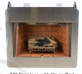
36" Fireplace with Warm Red Stacked Brick Refractory.