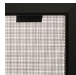
Safety Screen Barrier