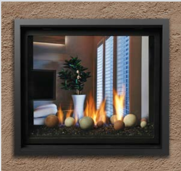
The unit illustrated is a MCVST42NH See Through Fireplace - Natural Gas, ZCV42S2PFBL Surround Picture Frame 1 5/8" Wide, MST42GT Glass Tray, ZG5C Glass Media - Bronze x (5), RBCB1 Cannonballs, MST42PL Porcelain Liner.