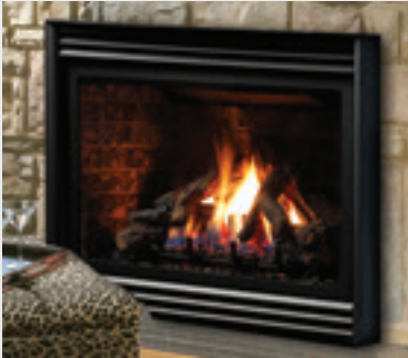
IDV43N Direct Vent Insert – Natural Gas, I43LK Louver Kit, LOGF36 Log Set, IDV36RLT Refractory Brick Liner – Traditional.