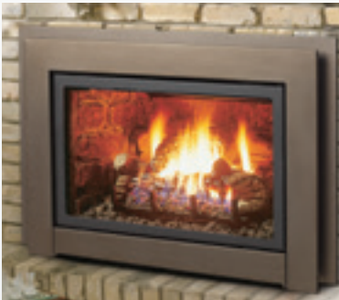
Unit illustrated is a IDV33LP Direct Vent Fireplace Insert – Propane, LOGF35 Split Fiber Oak Log Set, I33CVCV Clean View Kit – Copper Vein, I33SS1CV Surround for Clean View – Copper Vein, IDV33RL Refractory Brick Liner.