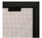
Safety Screen Barrier

On/Off, Thermostat On/Off, Thermostat On/Off modulating