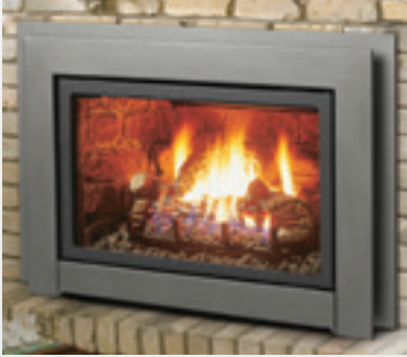
Unit illustrated is a IDV33LP Direct Vent Fireplace Insert – Propane, LOGF35 Split Fiber Oak Log Set – I33CVPW Clean View Kit – Pewter, I33SS1PW Surround for Clean View – Pewter, IDV33RL Refractory Brick Liner.